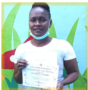
Teacher of the Month October 2021